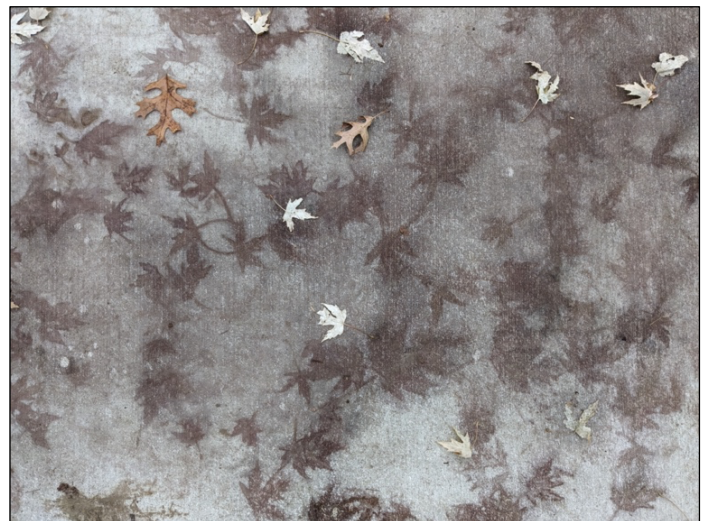
Leaf pattern on a winter sidewalk, Iowa City.