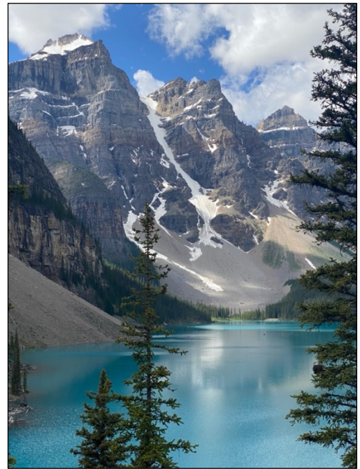
Moraine Lake, Banff National Park, Alberta, Canada.

Judges' comments: Lovely setting with a composition nicely framed with the trees to add depth to the photo.