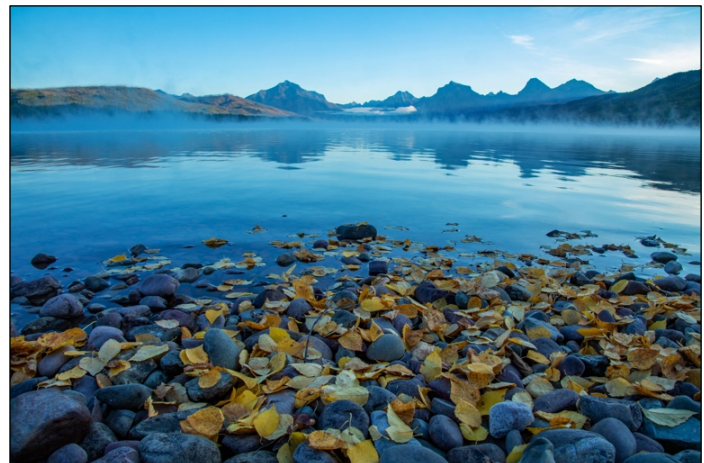
Lake McDonald, Montana.